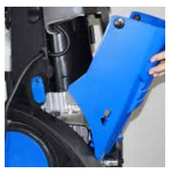
Cabinet can be removed quickly for direct access to the motor pump.