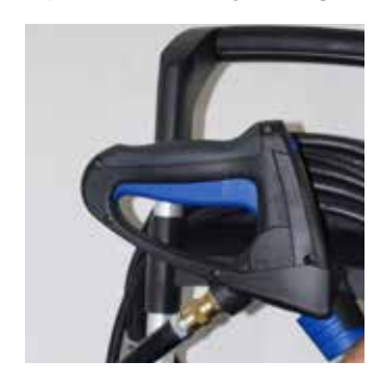
Unique patented Spray Gun Holder protects the gun from falling on the ground and being dragged behind the machine – preventing damage.