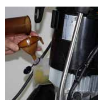
Pump oil tank with oil level sight and fill/empty function.