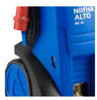
The turnable cable hook makes winding and unwinding of the lelectrical cable child's play.